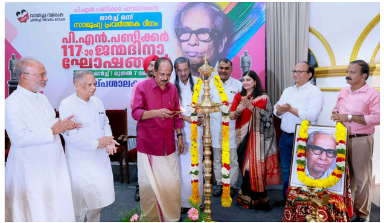
Lighting of the lamp during the workshop,