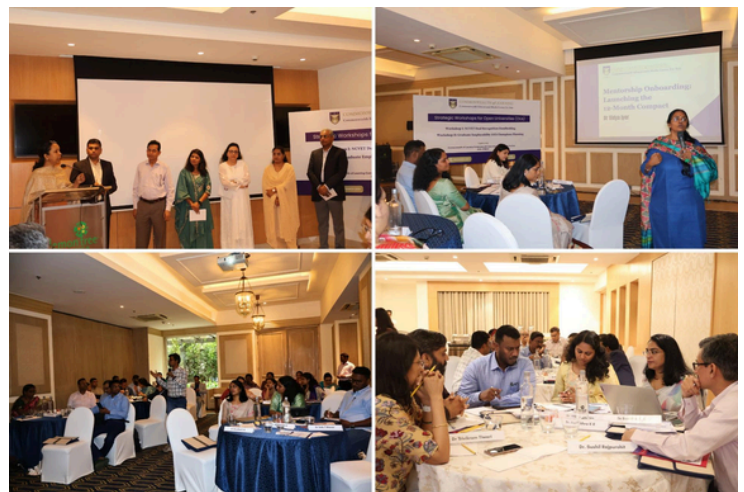
Glimpses from the workshop.