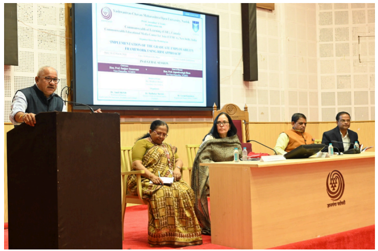
Workshop in progress at YCMOU

A key outcome of the workshop was the enhancement of fourteen academic courses, including AI for Teachers, Digital Literacy, Entrepreneurship Development, and Introduction to Fintech. These courses were