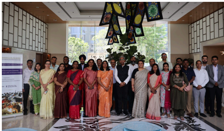
Group Photograph of the participants.

the urgent need to embed skilling, reskilling, and upskilling into their core mandate.