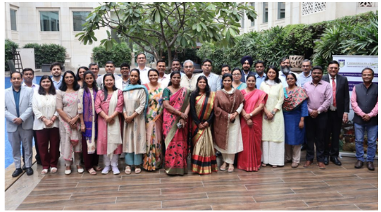
Group photograph of the participants.