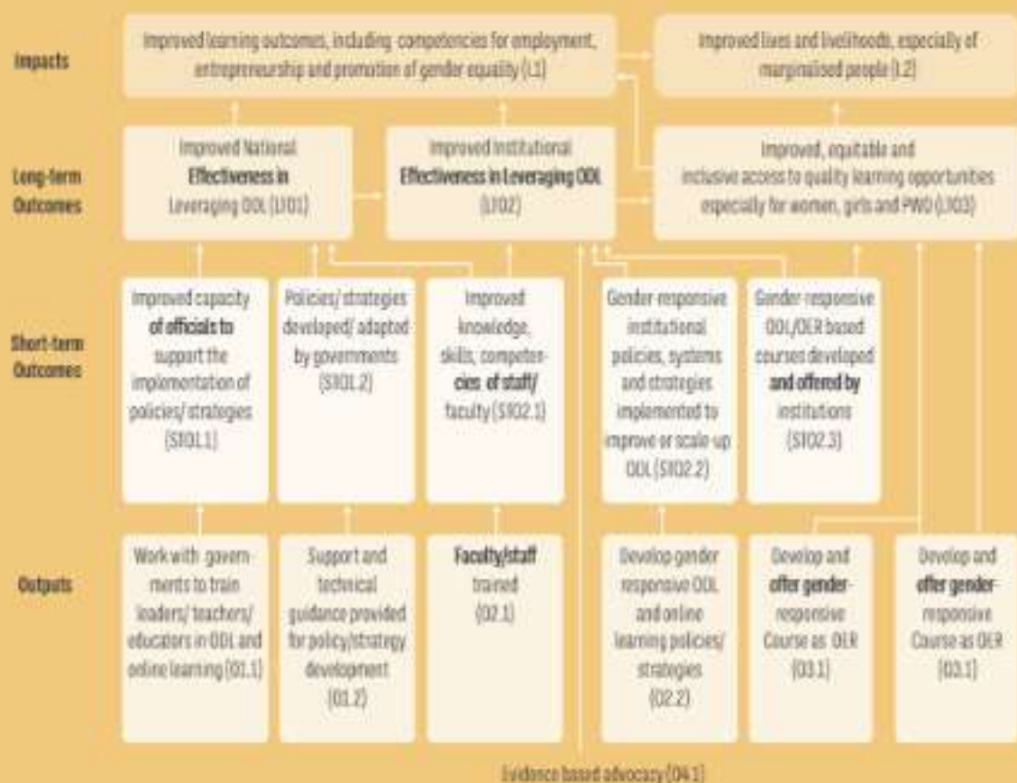
Figure 1: CEMCA Education Sector Logic Model

Figure 1 describes the Logic Model for the Education sector with expected outputs, outcomes and impact for the period 2021-2022.