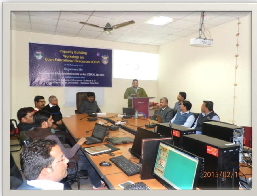
Figure 15: Feedback by participant