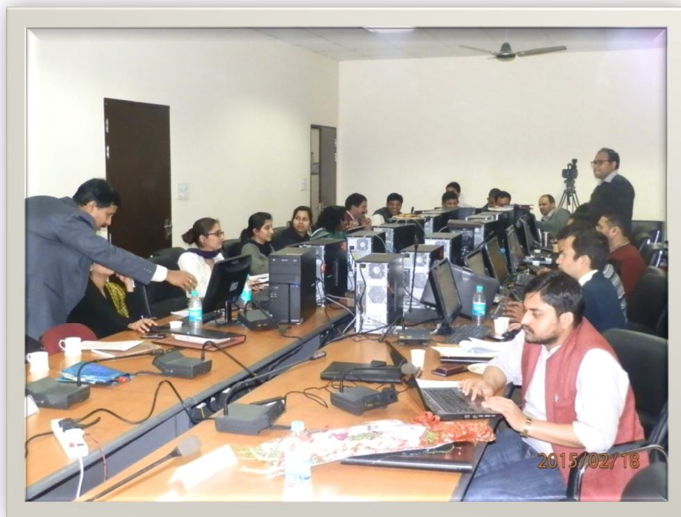
Figure 12: Hands on Session