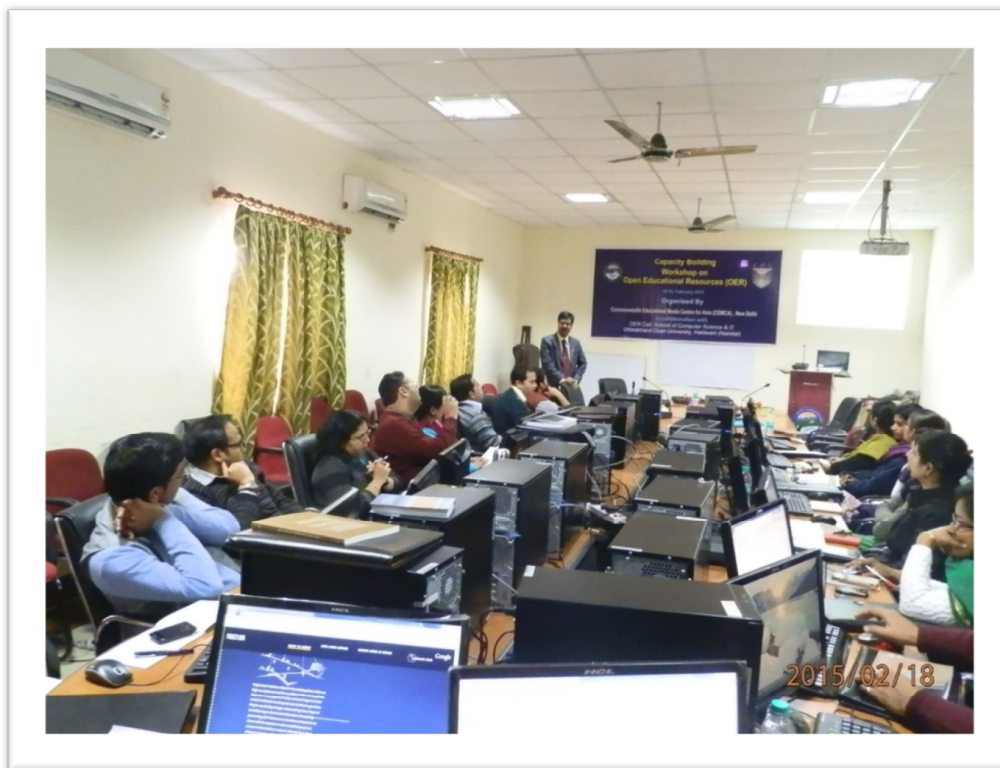
Figure 10: Understanding OER & OER Foundation by Dr. Manas Ranjan Panigrahi

Practical Session of the first day was started with the creation of account and user page in wikieducator. Participants practised basic text editing on WikiEducator using simple text markup to format particular elements of the page (e.g. bold, italics, headings, etc).