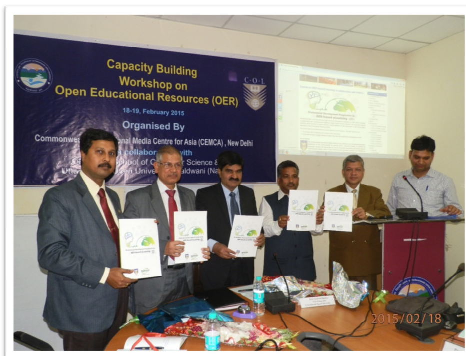
Figure 7: OER based elearning course launch

The course shall be offered free of cost to all the learners. However, the learners opting for the certificate after the completion of course shall be provided with the opportunity for enrolling for online exam on nominal payment. The successful candidate shall be awarded with a certificate of the completion of the course.