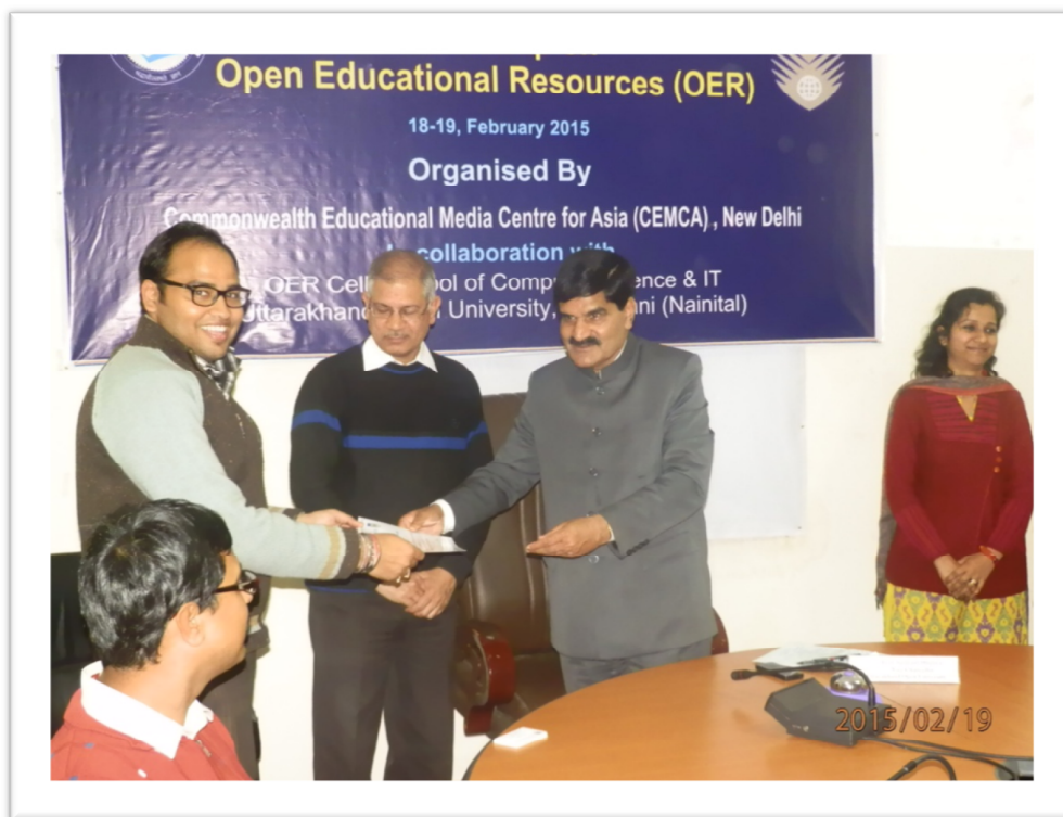
Figure 16: Certificate Distribution