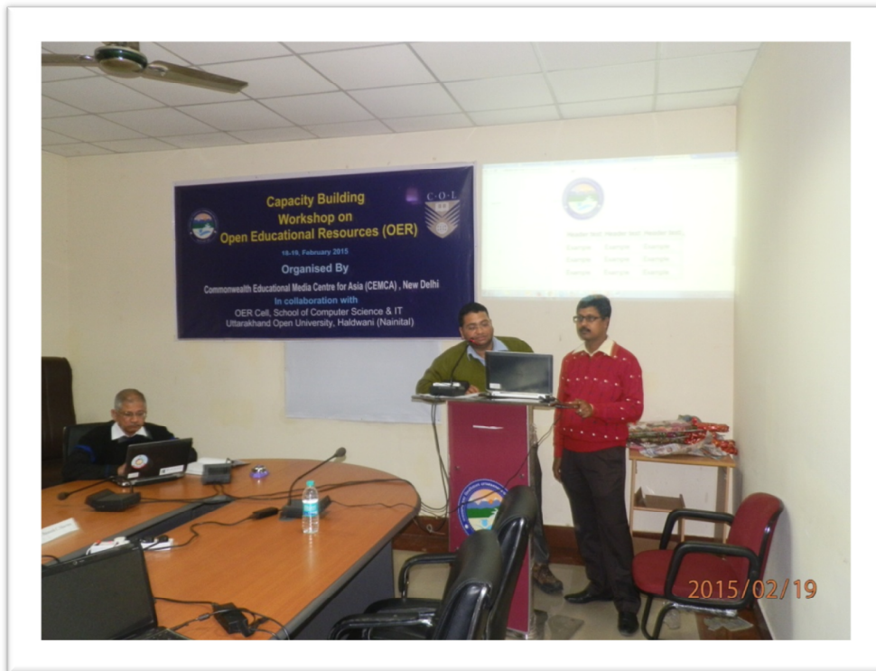
Figure 14: Presentation by Participant