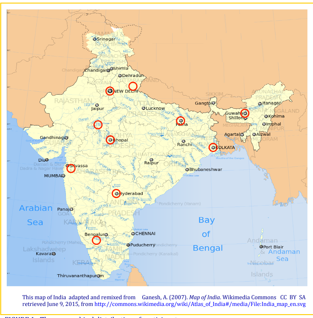
FIGURE 1: The geographical distribution of participants

Concerning the gender ratio, overall there were 18 male and 3 female participants, which reflected the gender ratio in senior positions involved in ODL in India. This Workshop was not aimed at beginners in ODL and not aimed at junior faculty, so reflectively there were more male than female participants. There are efforts to close the gender-opportunities gap demonstrated by policies on equality and equity. The challenge has shifted recently to achieve economic development, efficiencies, and accountability - in the expectation that these will contribute to reducing the bias against women in educational opportunities.