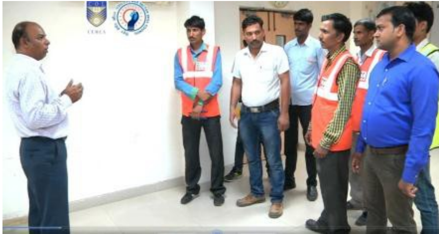
First Video – No Teamwork