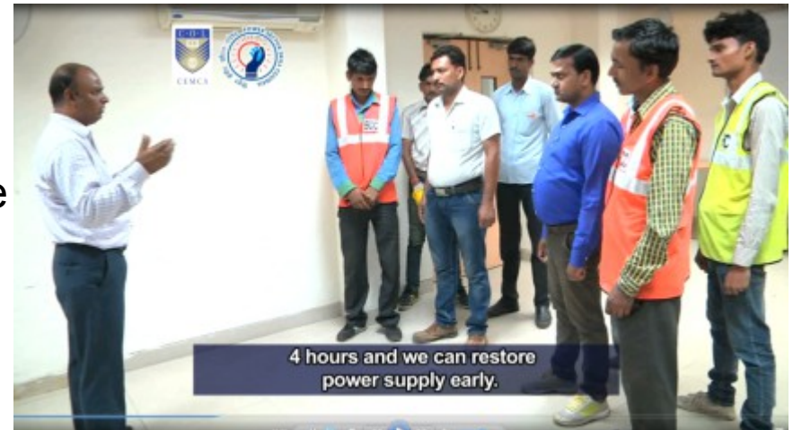
Second Video – Good Teamwork