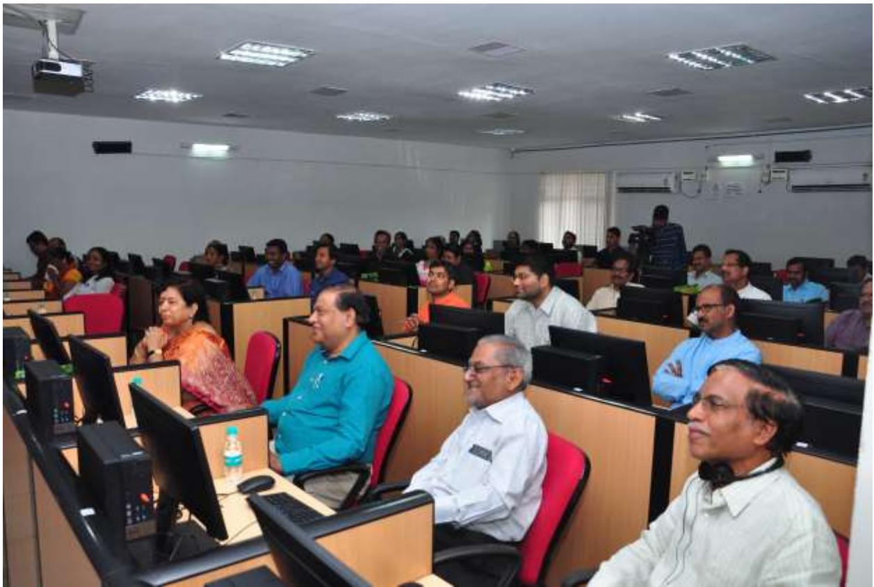
Participants of the Inaugural Function

The training approach of the workshop was hands-on practice and also learning-by-doing. The day-I of the workshop was focused on changing course format and layout, start date, topics, CC by SA licensing, URL, multimedia content, create a course introductory video using Screencast-O-Matic etc.