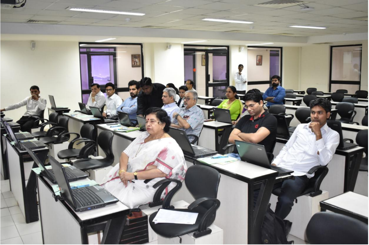
Participants at the workshop