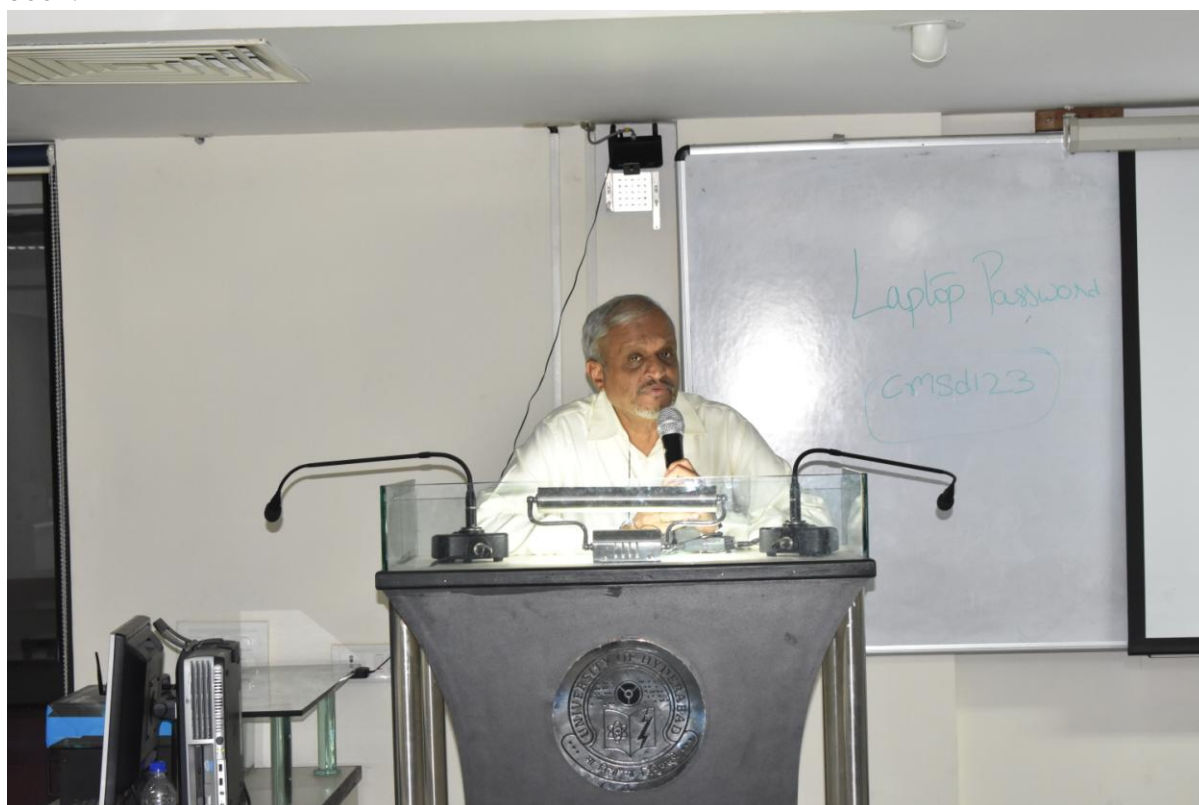
Prof. B.P.Sanjay, Pro Vice-Chancellor, University of Hyderabad at the inaugural session of the workshop

The present workshop is advanced training programme (Workshop) conducted for 20 faculty from different disciplines to equip the teachers of University Hyderabad with the skills required to develop and deliver eCourses with multimedia content; individual and collaborative learning activities; and assessments through Moodle. It was conducted in hands-on training mode and learning by doing. The faculty have actively participated in the workshop. The workshop dealt with the topics such as funding OER in multimedia, Question Bank and Question types, creating MCQs, creating and awarding badges and managing grade book.